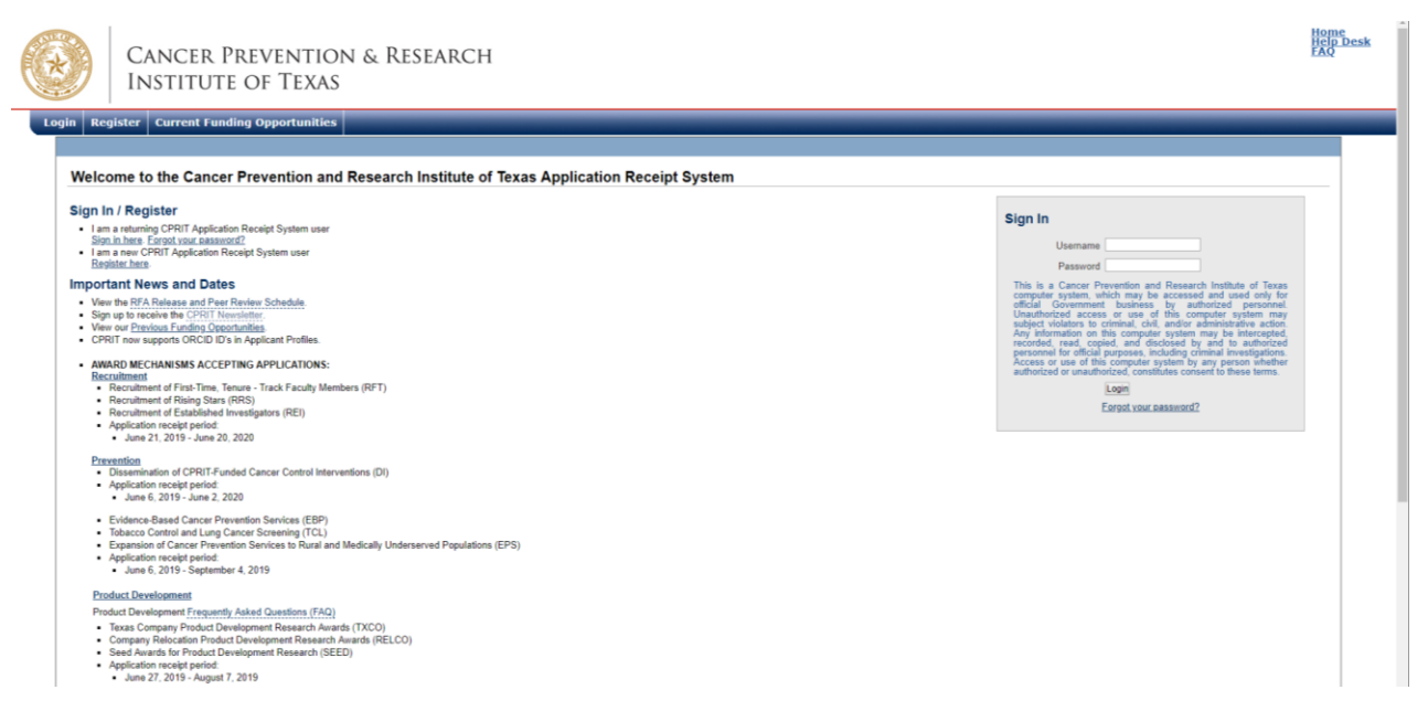
Figure 1: CPRIT Application Receipt System (CARS)

<u>Use of the electronic system to submit an application is required</u> - All applicants must use CPRIT's designated application system located at <u>www.cpritgrants.org</u> to electronically submit applications to CPRIT. Below is a screenshot of the log-in page for CARS.