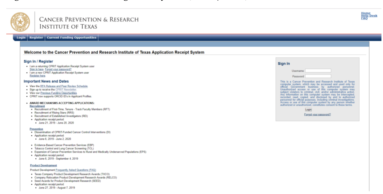
Figure 2: CPRIT Grant Management System (CGMS/CARS)