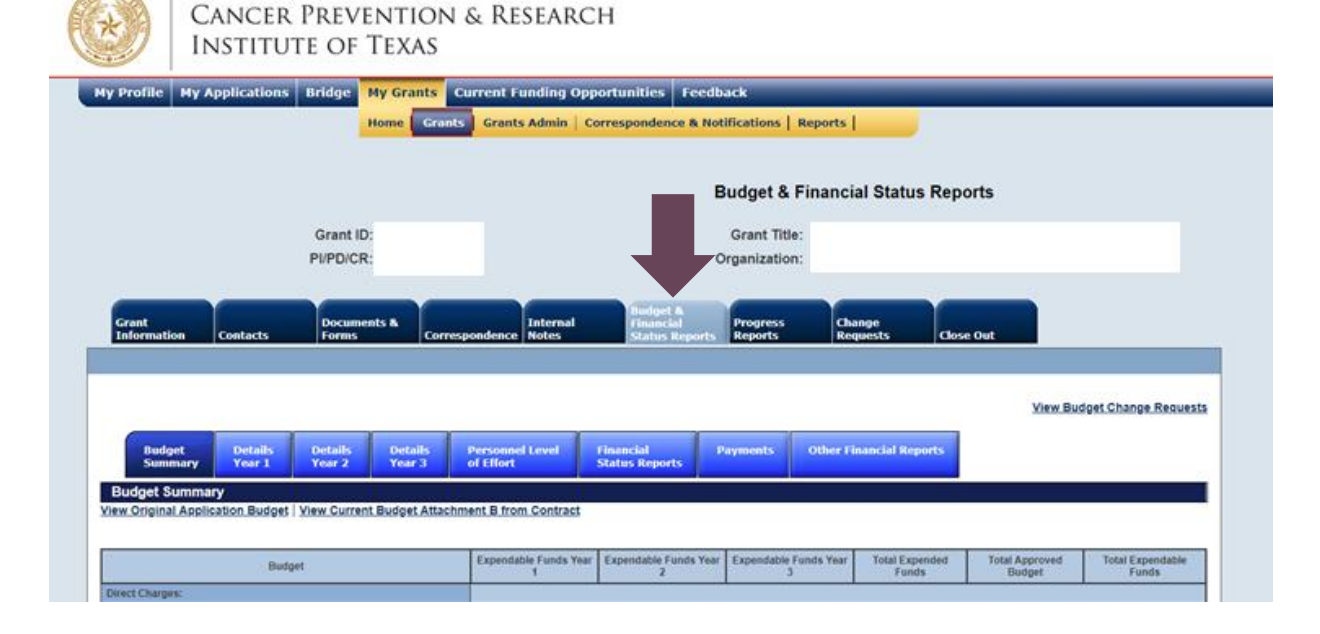
Figure 4: CPRIT Grant Management System (CGMS) "Budget & Financial Status Reports" tab

FSRs must be submitted in CGMS/CARS in the "Financial Status Reports" sub-tab located under the "Budget & Financial Status Reports" tab.