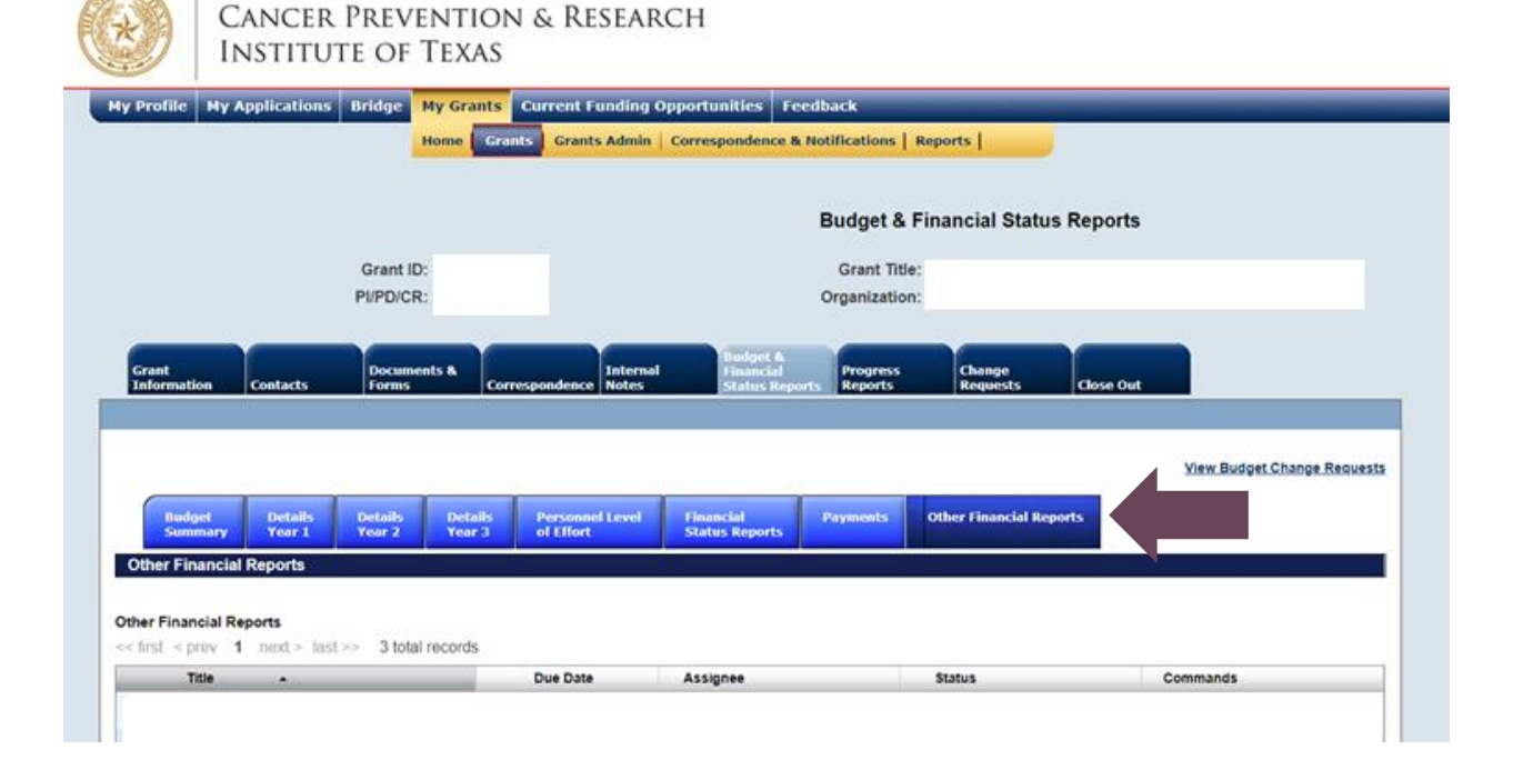
Figure 6: CPRIT Grant Management System (CGMS) "Other Financial Reports" subtab