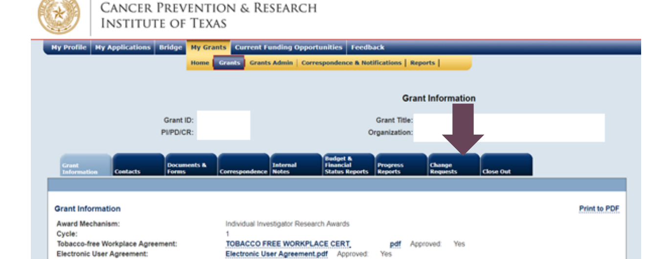
Figure 3: CPRIT Grant Management System (CGMS) "Change Request" tab

CPRIT may also initiate a contract amendment. A change to one or more contract provisions is not final until executed by CPRIT and the grantee. All final contract amendments are reflected in Attachment F (Contract Amendment), unless the change is made to Attachment B (Project Budget).